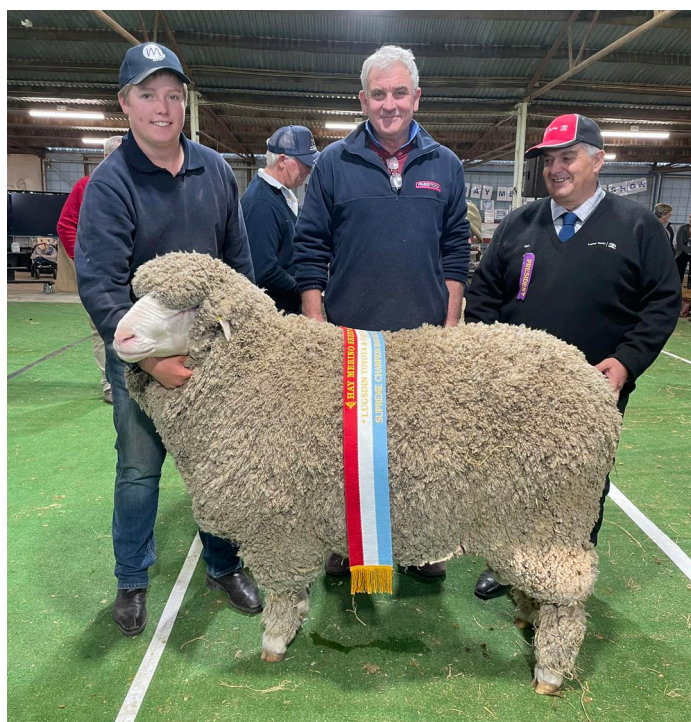
2023 Bill Lamb Perpetual Trophy- Mulloorie