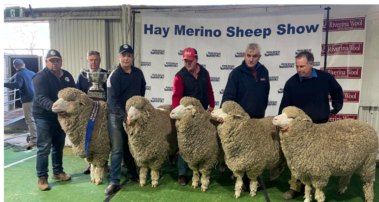
2023 Neilson Mills Memorial Trophy - Mulloorie