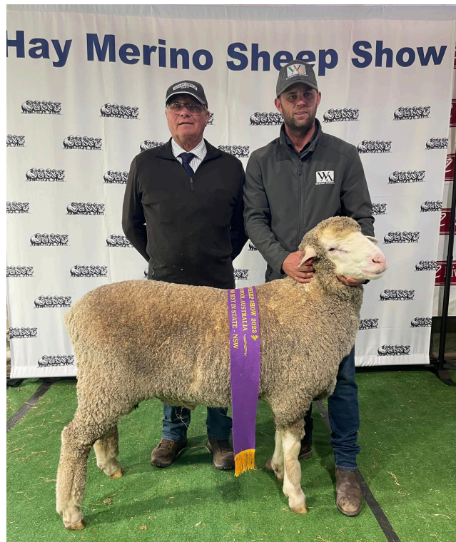
2023 Riverina Wool Australia Champion Hoggett Merino Ram Best of State (NSW) - WestRay Merinos