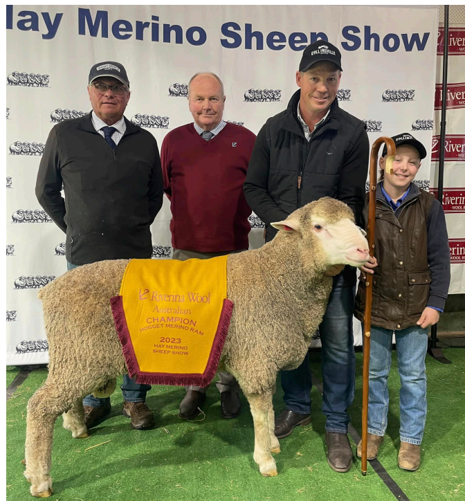
-Collinsville- 2023 Riverina Wool Australia Champion Hogget Merino Ram

Free Gate Entry sponsored by Bendigo Bank- Hay Branch