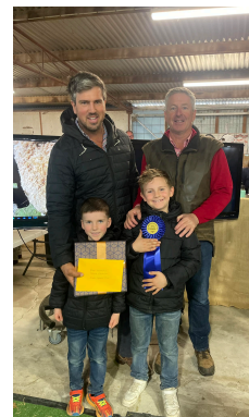
2023 Most Successful Exhibitor, Flock section - Piney Range-

~ $500 Cash ~ Most Successful Exhibitor in the Flock Section. Classes 5 & 10 excluded. Points will be awarded as follows:-1st-5, 2nd-4, 3rd-3, Champion-2, Reserve Champion-1