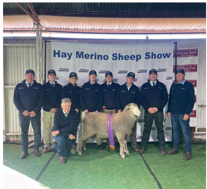
2023 Elders Champion March Shorn Ram - Poll Boonoke

Winners from Champ Med & Champ Strong Wool Ewe Wanganella Trophy $300 cash & Book Prize