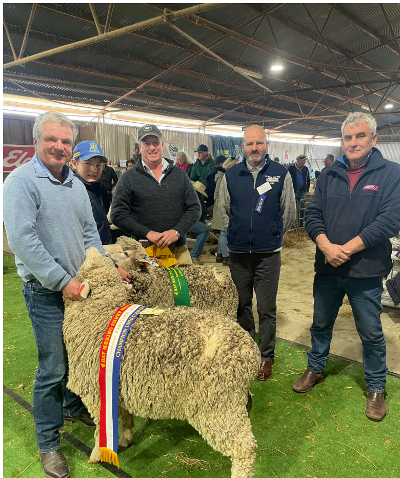
2023 Champion Unhoused Ewe - Woodpark Poll

FOX & LILLIE SPECIAL PRIZE For the Most Successful Exhibitor in the Unhoused Section. Points will be awarded as follows:- 1st-5, 2nd-4, 3rd-3, Champion-2, Reserve Champion-1